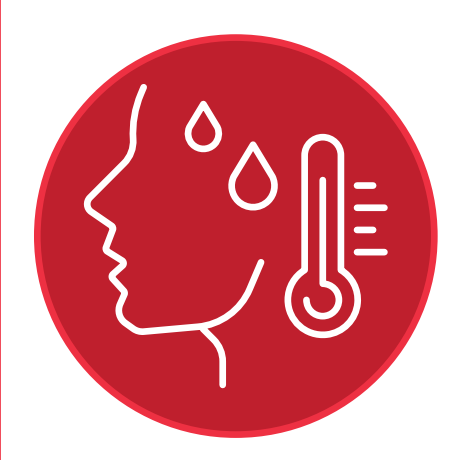
TEMPERATURE OF 100.4 F OR HIGHER

If other symptoms develop, remain home and contact a healthcare provider. Refer to the district's COVID-19 Response Protocol for details on when it is safe to return.