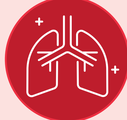
SHORTNESS OF BREATH OR DIFFICULTY BREATHING