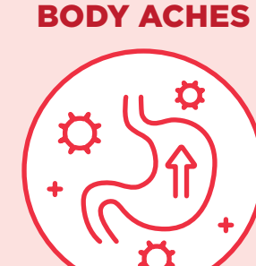
NAUSEA OR VOMITING