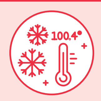
FEVER OR CHILLS