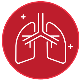
JEPJEP MENOWÖM AK IKKIJE LOK