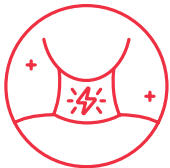
METAK KABIN BURUWÖM