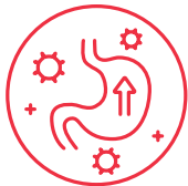
MÖLANLÖN AK EMMÖJ