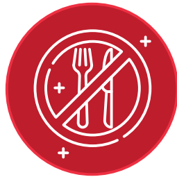
NE KWOJJAB NEMÖKE AK AT BWIIN JABDREWÖT