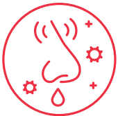
KALO UBÖM AK TOOR BOTIM