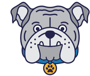
HEAD + PAW TAG