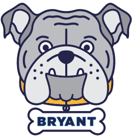
HEAD + SCHOOL BONE TAG