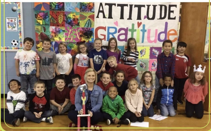
Second grade enjoys their classroom activities!