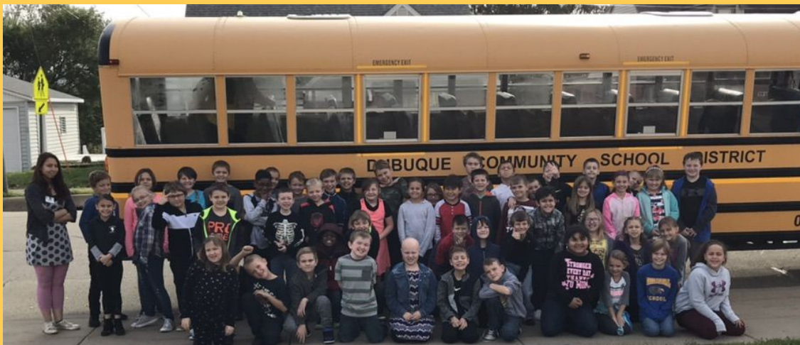
Third grade on the way to the an Art's Trek at Five Flags Theater on a PTO sponsored bus!