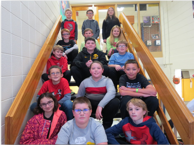
Grade 5 Sageville Band Students!