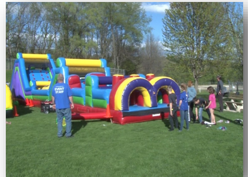
Bounce House is a big hit!