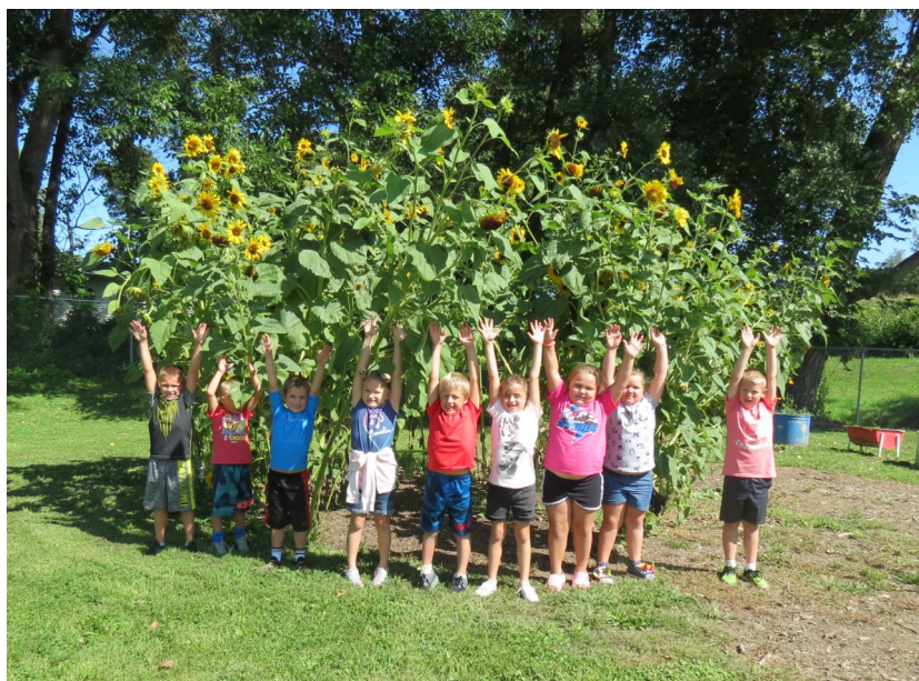
First graders are trying to reach the sunflowers!

Scout Night is next Monday. I hope you get a chance to check it out!