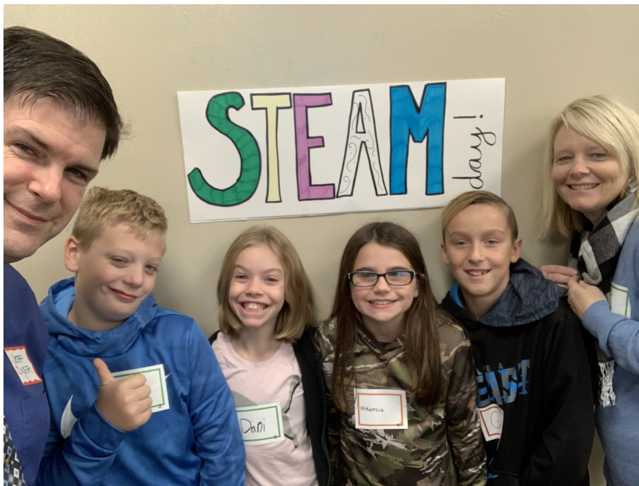
Steam Club is rolling every Wednesday!