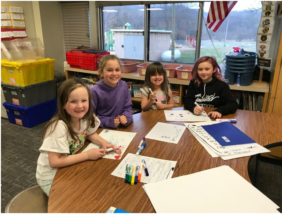
These Sageville family team members enjoyed making placemats for Albrecht Acres