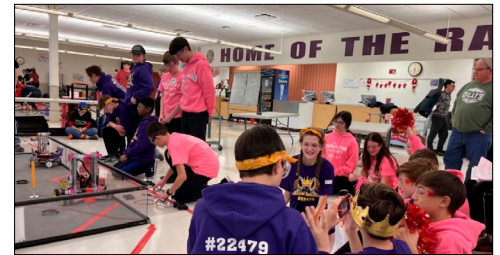
We hosted a meet on 12/17/2022 at our school. Practicing our core value of having fun together!

The next big step for our teams is the League Tournament coming on January 14th. This is the meet that decides whether we can go onto the Super Qualifier and then the Iowa Championship. We hope that everyone at the school will show their support for these extremely hard-working students. One of the best ways you can do that is to follow the teams on Instagram!