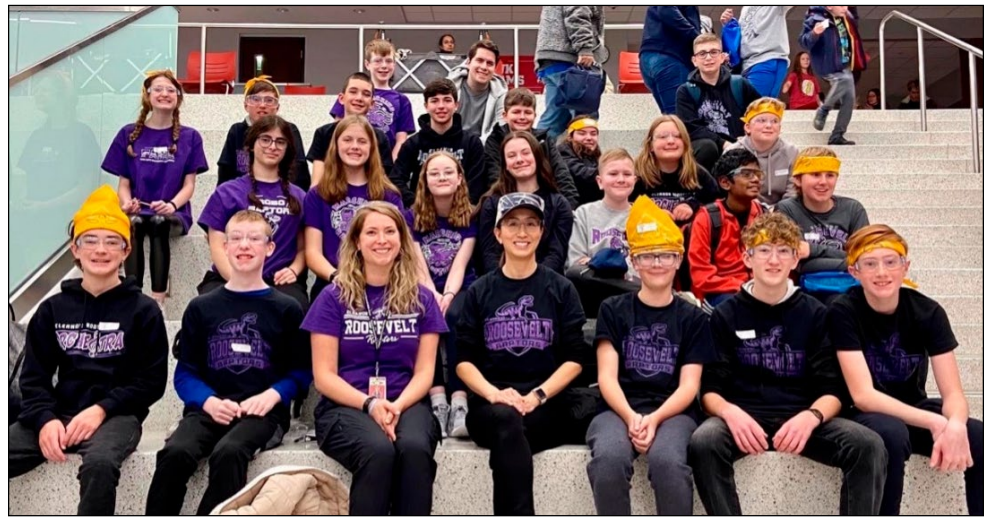
First meet in Iowa City 11/19/2022