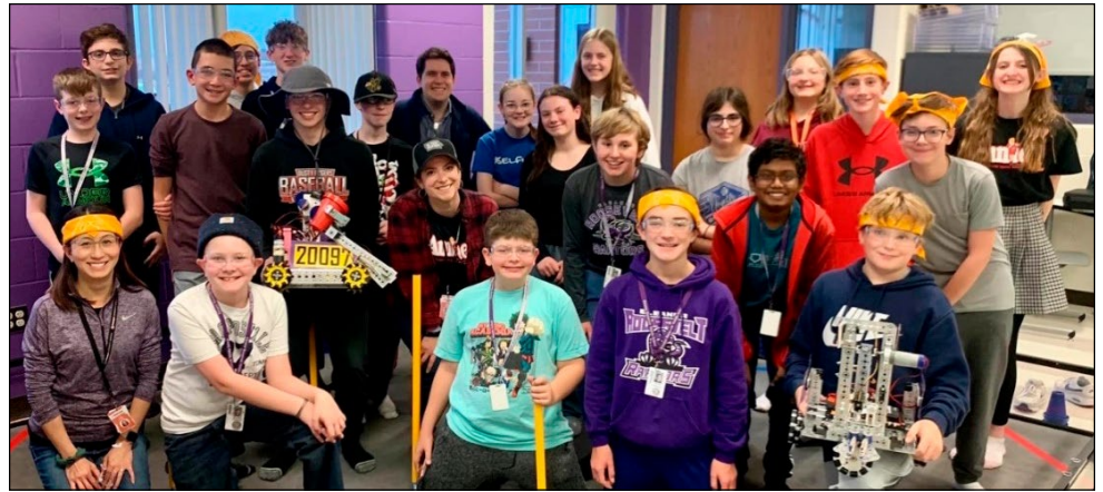
Getting ready for our first meet. Check out the big smiles on their faces!

Another fact of the team that worked very hard to market the team brand, collaborate with mentors, and participate in outreach with the community. We created tri-folds, posters, t-shirts, pins, pens, business cards, stickers, and decorations for the meets. Fundraising was essential for having enough funds to purchase materials needed for our teams. Several members also managed our social media accounts, such as Instagram. Our teams even have a YouTube channel where we post vlogs!