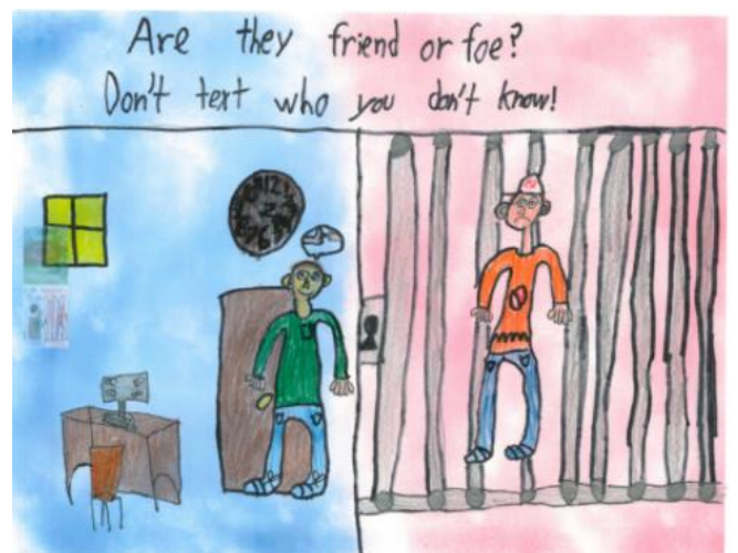
Ethan Waddick (2019) State Winner